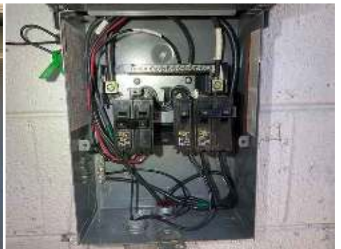
Second Panel Off