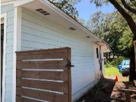
Right Side of House