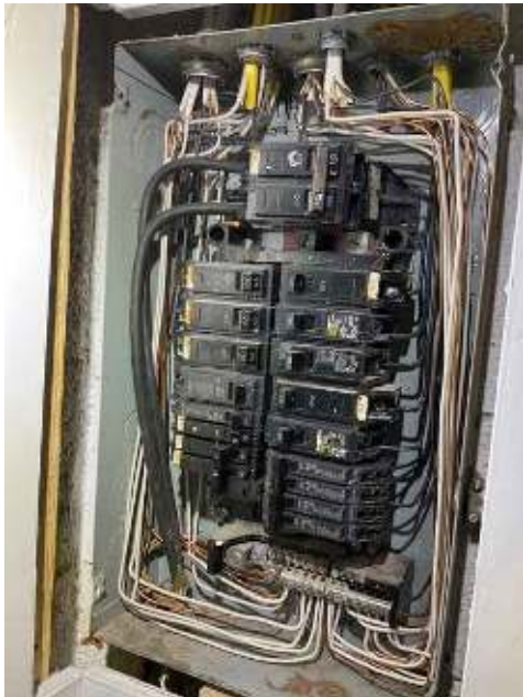
Third Panel Off