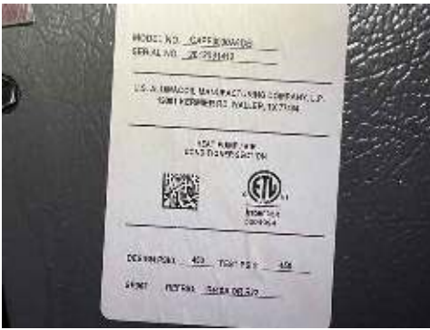
Dated Manuf. Plate (Air Handler)-December 2020