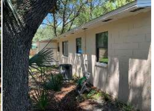
Back of House #2