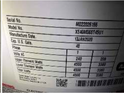
Dated Manuf. Plate-January 2020