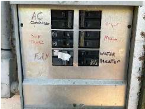
Main Panel On