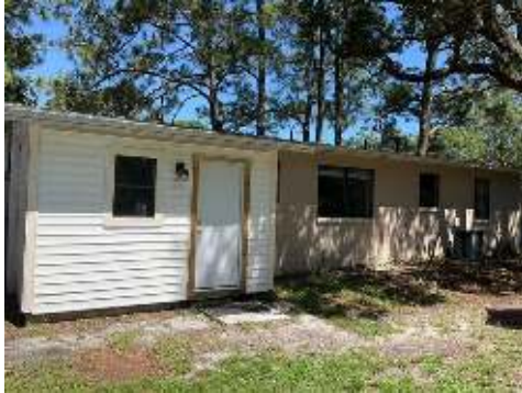
Back of House #1