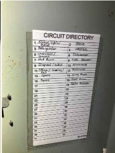
Third Panel Interior Door Label