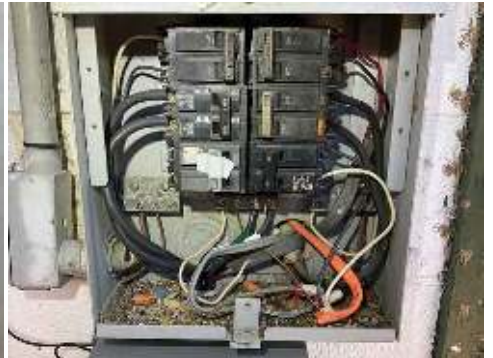
Main Panel Off