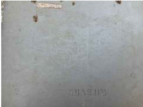
Main Panel Interior Door Label