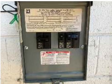
Second Panel On