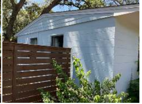
Left Side of House