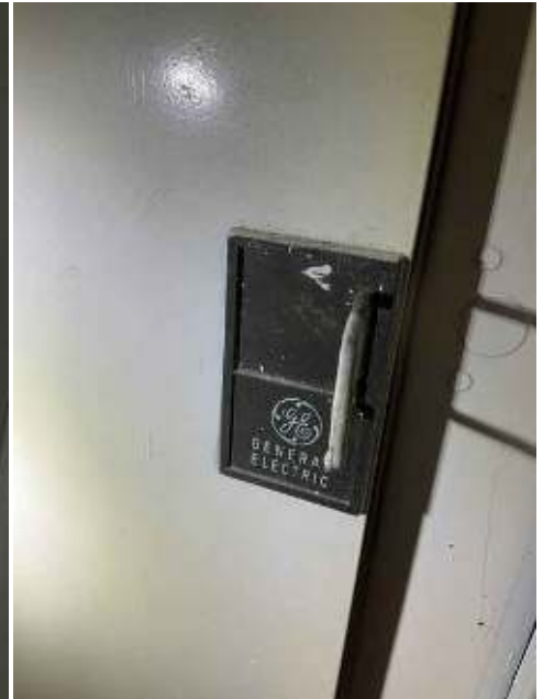
Third Panel Manufacturer