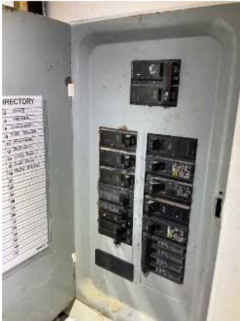
Third Panel On