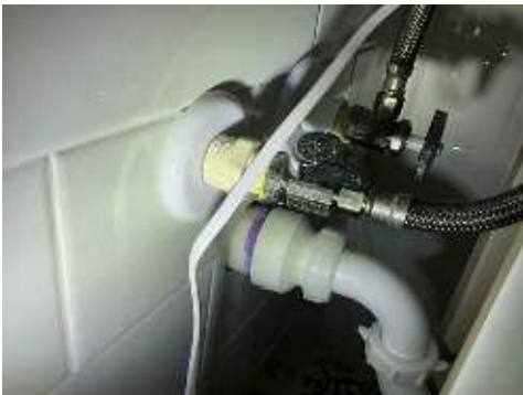
Under Cabinet Supply