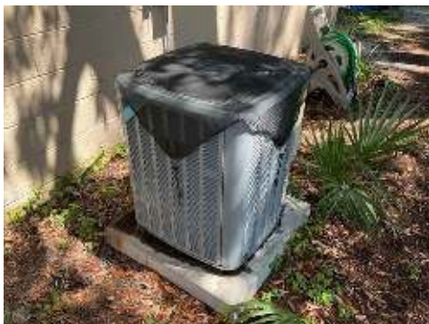
HVAC Equipment (Exterior Unit)