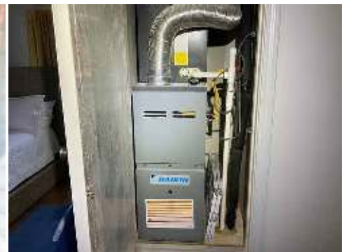
HVAC Equipment (Air Handler)