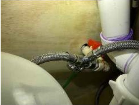
Under Cabinet Supply