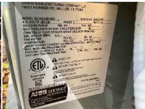
Dated Manuf. Plate (Exterior Unit)-August 2021