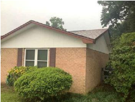
Right Side of House