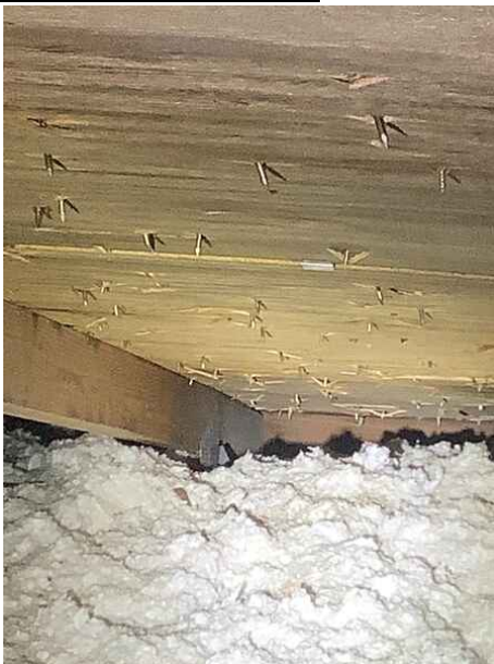
Metal Connectors #1 (4 Nails Noted)