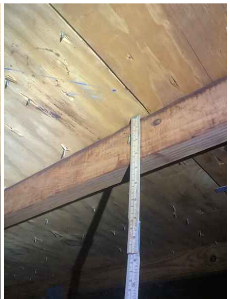
Fastener Size - 8d Nails

Inspectors Initials JP Property Address [REDACTED]