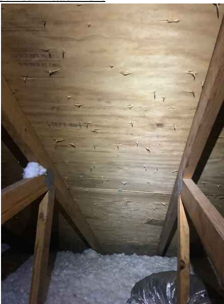
Deck Material - Plywood