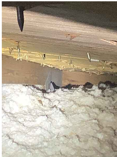
Metal Connectors #2 (4 Nails Noted)