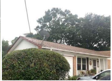
Left Side of House