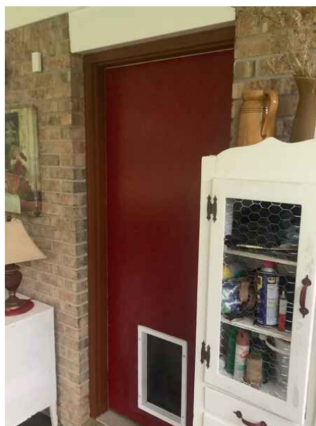
Rear Door Non-Rated