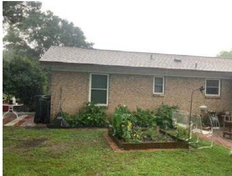
Back of House #1