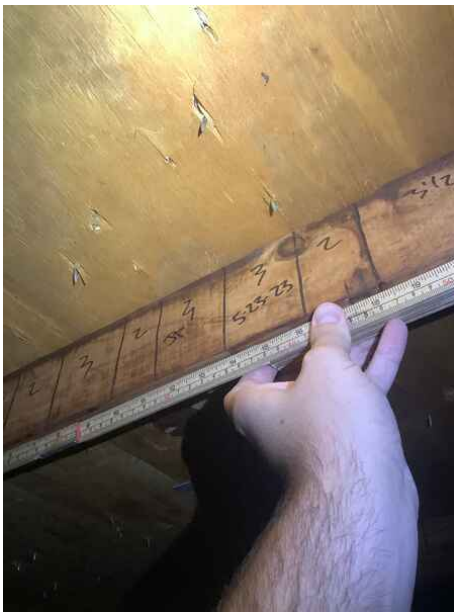
6" Nail Spacing #1