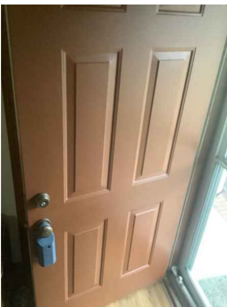
Front Door Not Verified