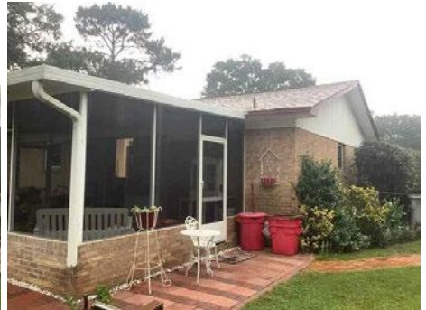
Back of House #2