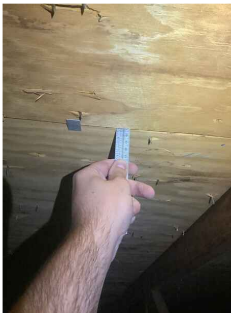
Deck Thickness (Approx 1/2")