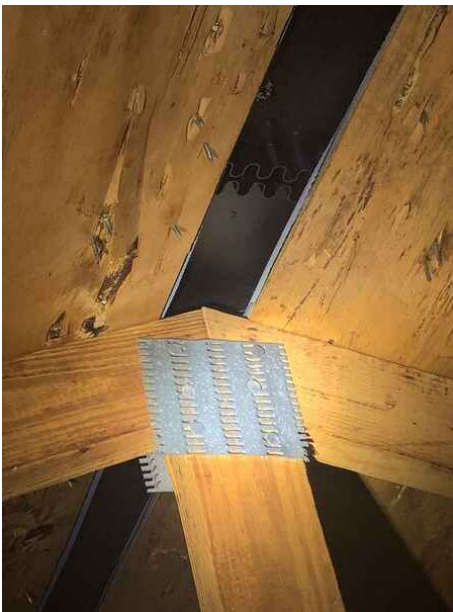
Unknown or Undetermined