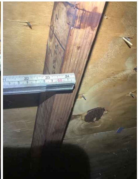
< Maximum of 24" O.C.