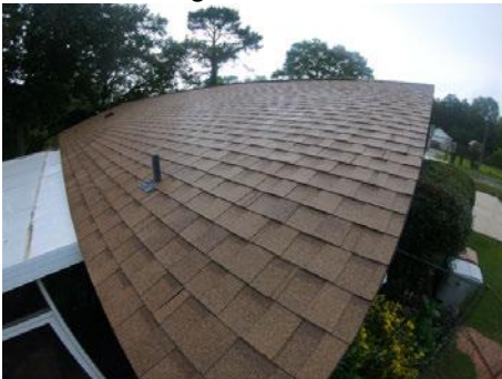
Asphalt/Fiberglass Shingle (Architectural)