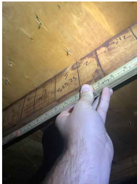
6" Nail Spacing #2